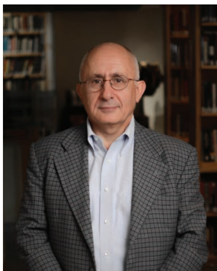
Kaloosdian Mugar Professor Taner Akçam.